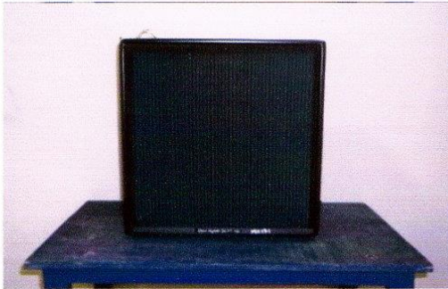
Sample Room Cleaner