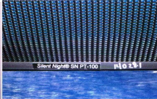
Name Plate ID Sticker

Notice: These data relate only to the samples tested. This report may be copied only in its entirety. pg 3/3 Performed By: MP Data Location: MP104